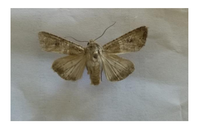
Fig. 1: Adult of Hadena multaniensis Sp. Nov.